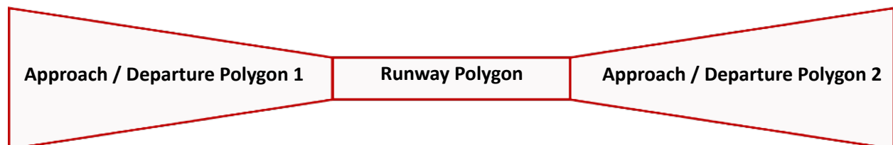
Figure 2: Example of Minimal Geofencing Capability

Protected high-risk areas can be represented by one or more generic or simple polygons that cover the airport surface area and may include regions under approach and departure paths.